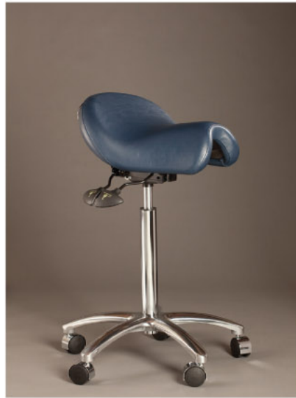
Classic Plus (Deep Sapphire)