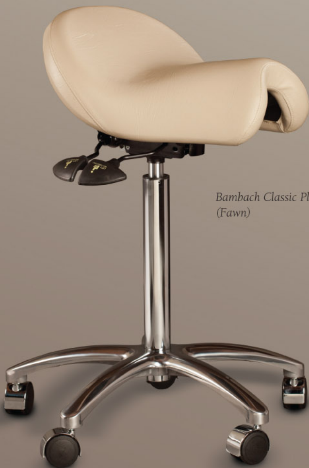
Bambach Classic Plus (Fawn)