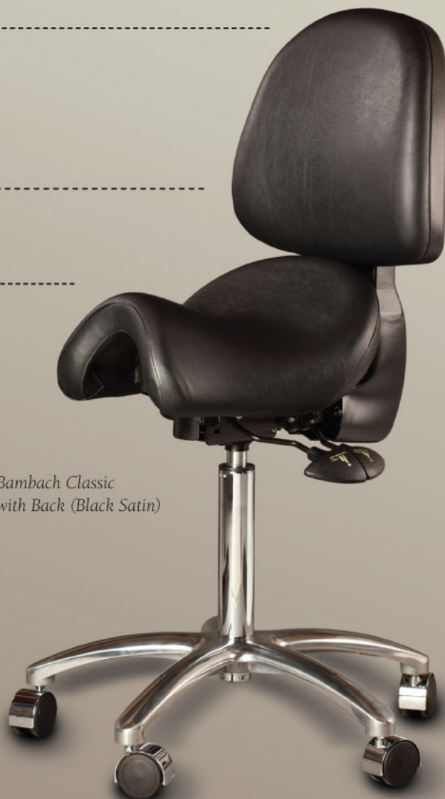
Bambach Classic with Back (Black Satin)