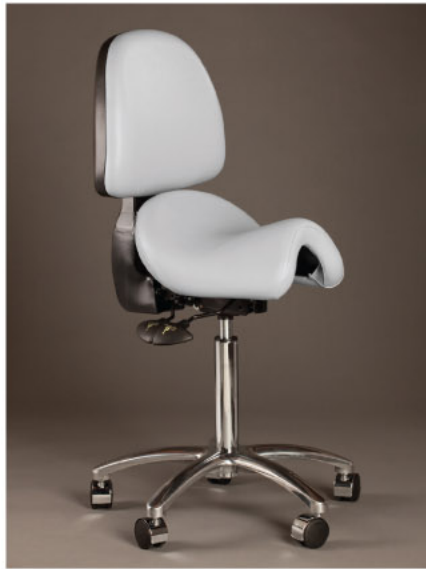
Classic with Back (Feather)