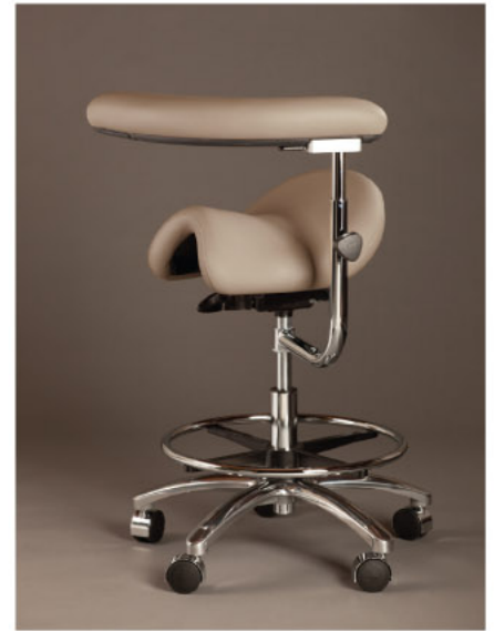
Left/Right Arm Rest & Foot Ring (Cocoa)